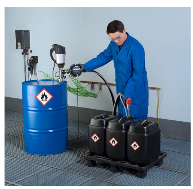
Semi-automatic canister filling in explosion zone 1.

The FLUX FP 430 Ex S barrel pump has been tested by the Physikalisch-Technische Bundesanstalt (PTB) and received EC design certification in conformity with ATEX guideline 94/9/EC in keeping with DIN EN 13463.