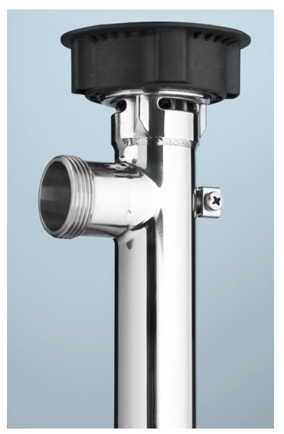
FLUX zone separation for barrel pumps.